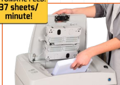
Up to 400 sheets paper tray for auto-feed system: 37 sheets per minute shredding speed