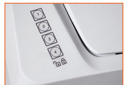
(Option) 4 Digit Electronic Combination Lock